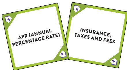
THE COST SET (2 CARDS) APR + Insurance, Taxes and Fees

Collect all matches in a set to earn bonus points for your team. Each card in a completed set is worth 1 bonus point .